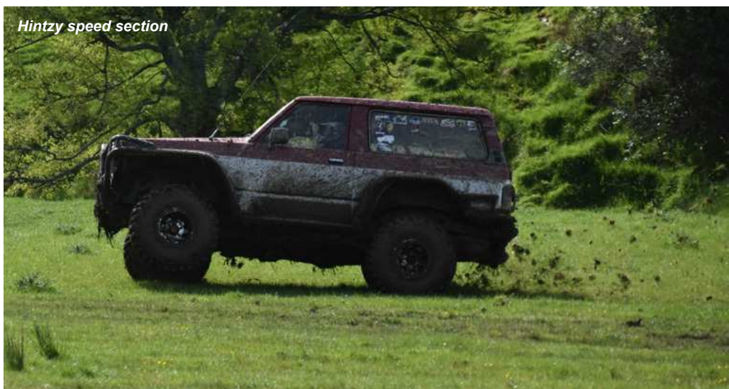
Hintzy speed section

All the comp details can be found at www.sporty.co.nz/czctc