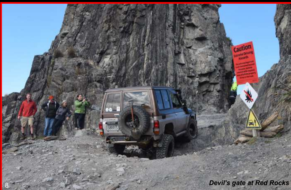
Devil's gate at Red Rocks

While discussing this very popular area, it is disappointing that a small number of 4x4's and motor bikes continue to act in a manner that