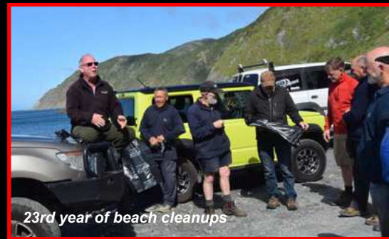
23rd year of beach cleanups