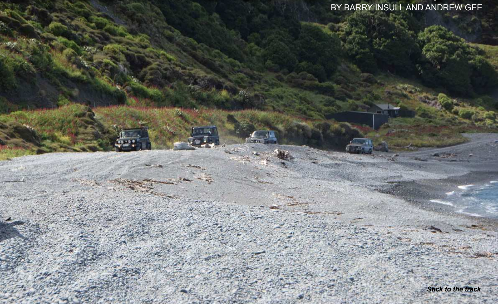
Stick to the track

Wellington's Cross Country Vehicle Club (CCVC) ran its twenty third annual clean-up of the "Red Rocks" coastline on the South Coast earlier this month. It is just part of the community work that the club does, perhaps this year's highlight was the introduction of 63 kiwis to Terawhiti Station as a result of CCVC's