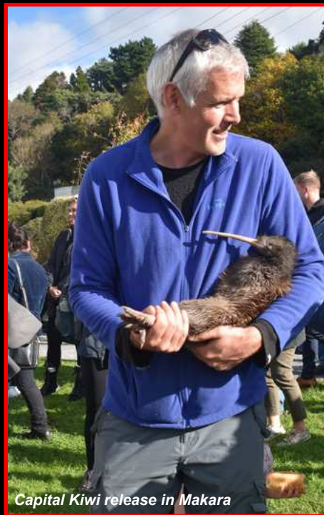
Capital Kiwi release in Makara

Enjoy the South Coast, stick to the track and share the area with all the users.