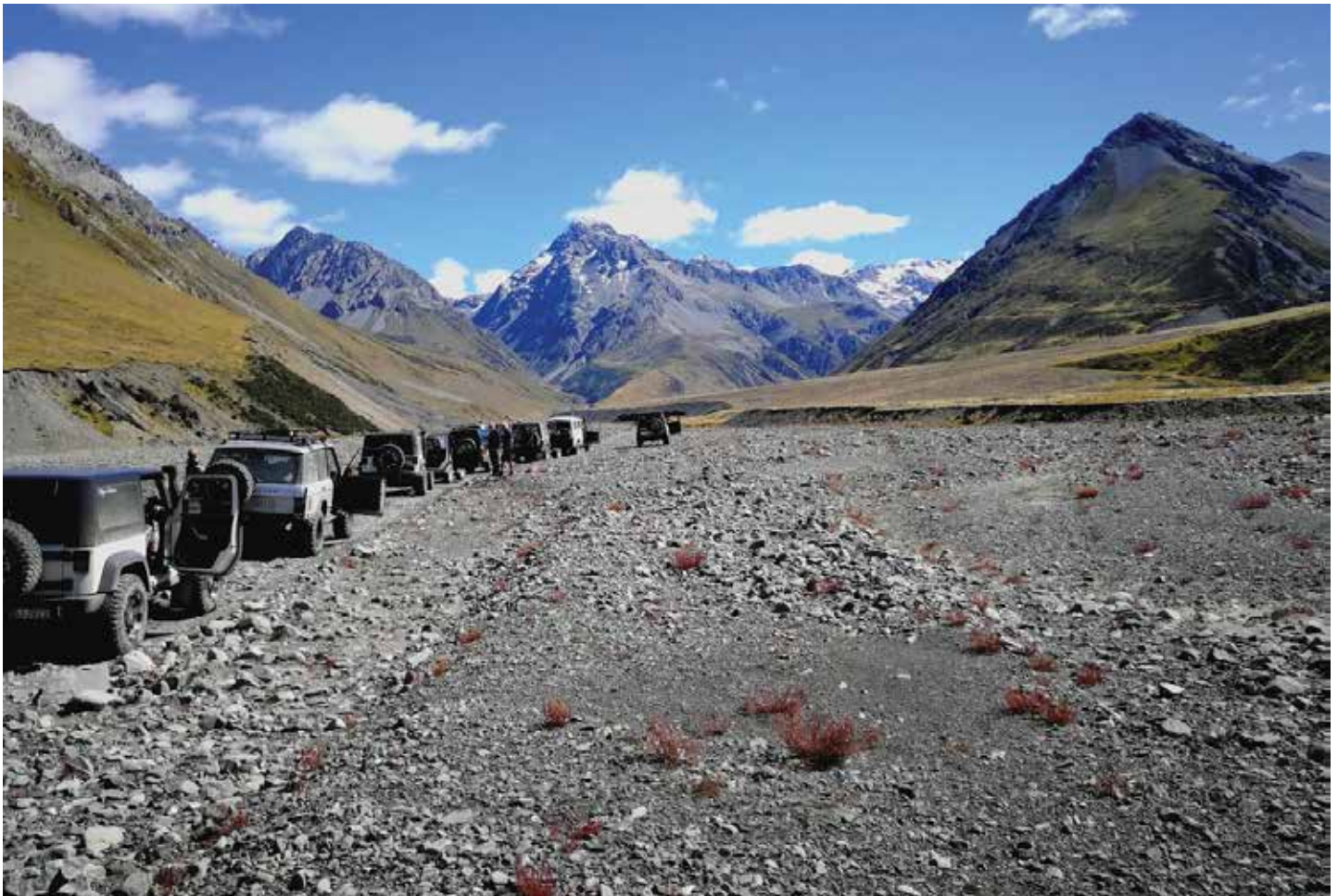
A stop along the way to admire the Cass Valley on the way to Memorial Hut.