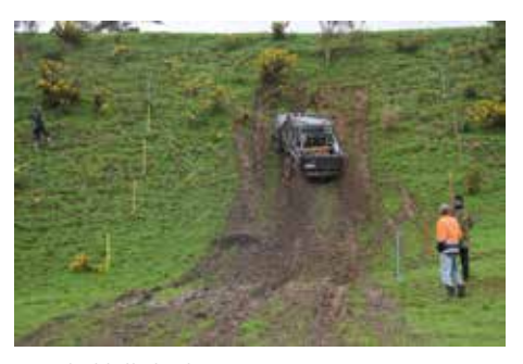
Graded hill climb