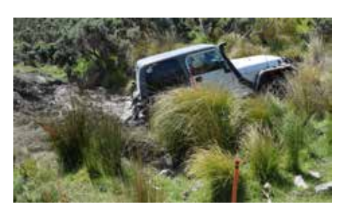
Scored 60 points

course to define the route and look for terrain features that will cause you problems. You need to know your vehicle, what clearance you have underneath, how the suspension reacts to terrain and how the engine and transmission deliver your power and torque. It's all a piece of cake. The key is keeping traction while you navigate the hazard. There are separate Classes to equalize the level of modifications between vehicles but changes to the engine or power output aren't considered, only traction aids be they LSD, lockers or nothing. I think that tells you what is considered more important, keeping traction over outright power and that also means you can compete in a fairly standard machine. Speed sections are great fun, akin to a bit of rally driving, you go as fast as you can over lumps and bumps and flying into the air is a bonus. Typically a speed section starts and finishes in a "garage", that is a standing start and you must finish precisely in a