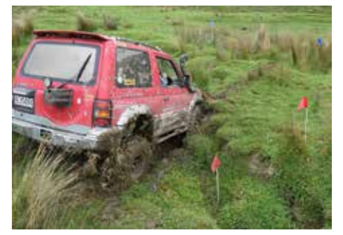
Ungraded hazard and finish blues

The vehicles are put into one of four different Classes according to the level of modification to even up the field, the rules can be found at www.czctc. org.nz. On arriving at the site the most important thing you can do is to lower your tyre pressures to let your tyres flex and work better in mud. A modification available on a number of models is to disconnect the front sway bar, it is common in Jeeps and gives the suspension more articulation. I take out as much weight as I can by removing the rear seat, spare tyre and tools and leave that stuff in the pit area. Some people drive to the event on mild tyres and change to aggressive tyres at the site. Do your paperwork and have your vehicle and helmet inspected by an official, now you are ready to get into action. The competition is a number of "hazards", that is short courses that are designed to be impossible to clear. They are marked out by using coloured pegs, a pair of blue pegs mark the start and finish of the hazard. The route through is marked by pairs of pegs, yellow on your left and red on your right, in a graded hazard these pegs carry the score that you earn as you pass them. The majority of hazards are graded but there are other types of test, most notably the Speed section or the ungraded hazard. Finally you start to drive the hazards, first you walk the