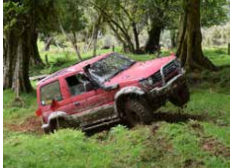
Brendan Watchorn Okoki