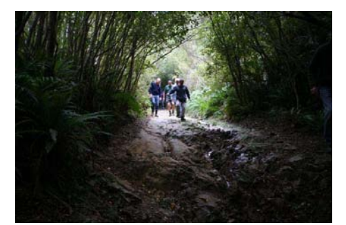
Walking the Rock Garden....