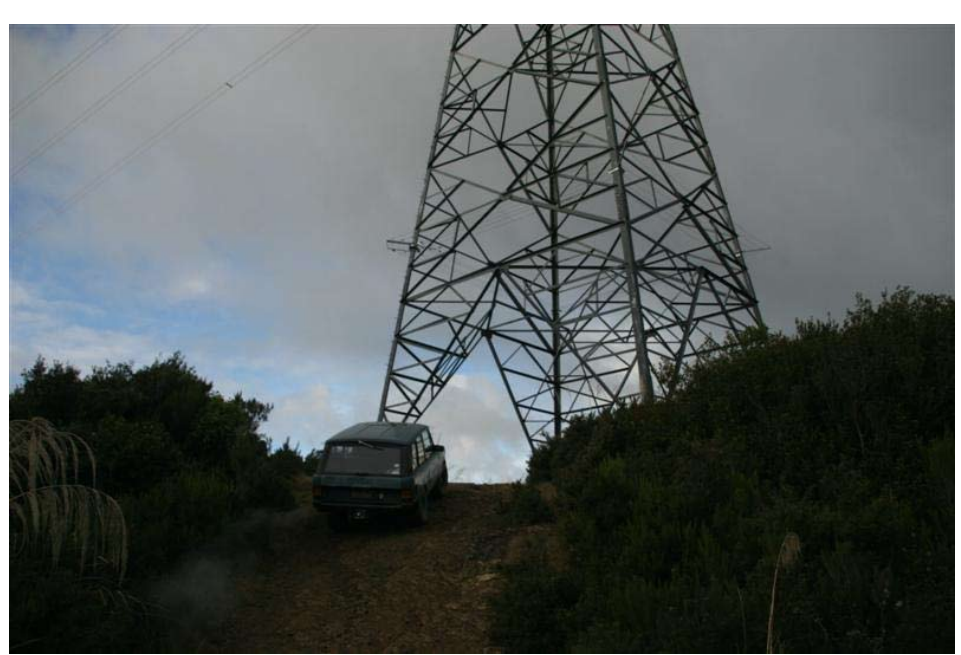
Hamish started 4WD'ing in the early 70's