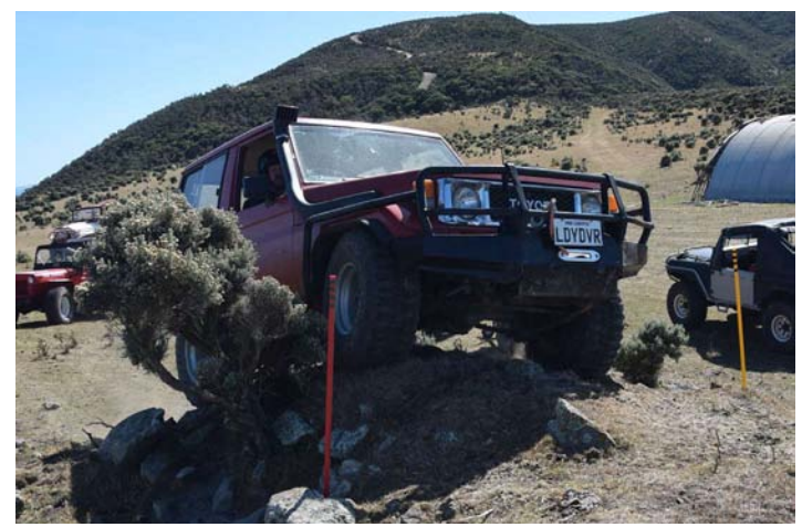
Alan Stone starts the rock pile hazard passing the inital climb for 80 points.