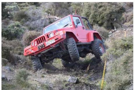
Bruce Tustin's TJ Wrangler is on flexy coil suspension probably with springs that are too