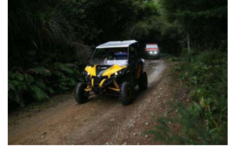
Everyone arriving for lunch