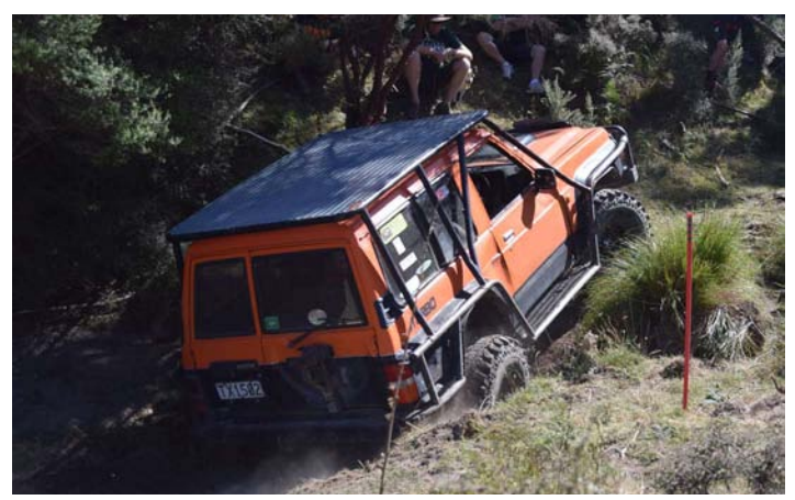
Deane Whitton uses the weight of the Class 3 Nissan to plough up the creek bed losing valuable momentum which he will need to make the turn at the top.