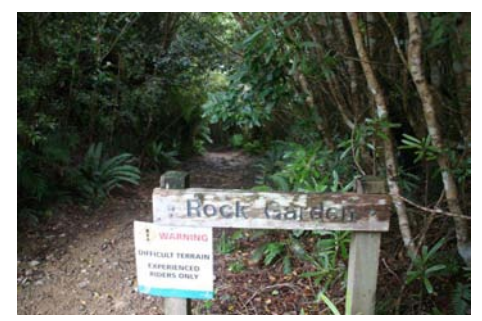
Experienced riders, drivers and no shiney's! But we can check it out on foot....