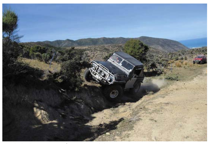
Neil Blackie goes too far in the sideling to tip over without much damage.