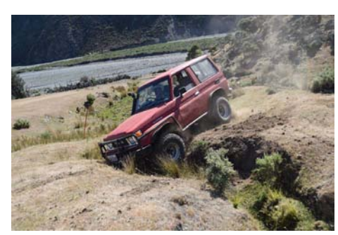
Shona Stone from Mt Egmont Club runs this Cruiser in Class 2 but runs out of clearance.