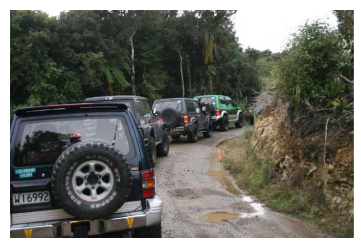
Stops were never for long.