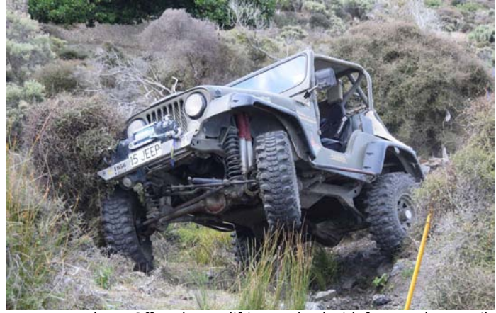
Don Morgan's TJ5 Offroad racer lifting a wheel with front and rear coil suspension.

Neil's Land Rover found its side angle limit and flopped over, fortunately without any great damage and a quick recovery was confidently carried out. A few hazards before Shona broke a CV joint in their Cruiser but they had a spare so she and Alan shot back to the pits to do a repair. They worked over the lunch break to make repairs and then finished the day and then headed back up the hill to finish the hazards they missed. While thinking about the spit roast meal to come that evening, Alan blew another CV joint and called it a day.