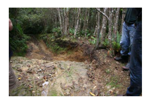
Can you see Pedro's marks from the top?