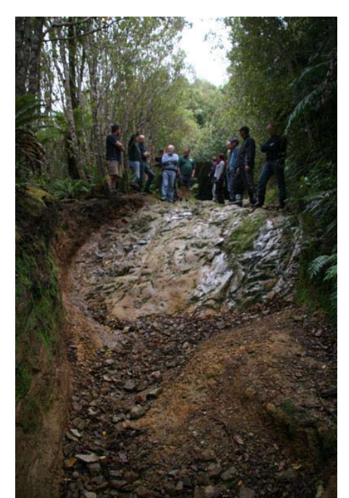
Sorry, the group shot photo was a fail, this isn't everyone.