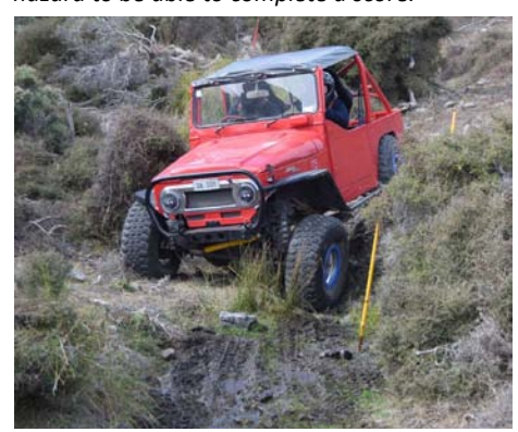
Mark Stockler's much modified 40 Series Landcruiser with coil suspension showing real flexiness