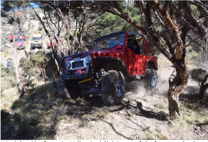
Mark Stockler from the Valley 4wd Club is one of the few to make the turn out of the creekbed.