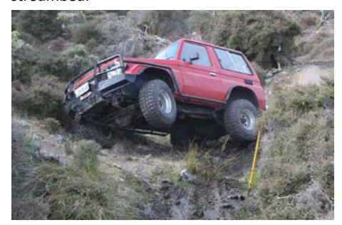
An example of a front and rear leaf sprung vehicle's articulation, Alan and Shona Stone's 70 Series Landcruiser.