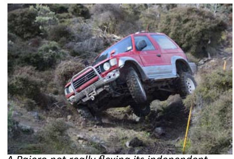
A Pajero not really flexing its independent front suspension.