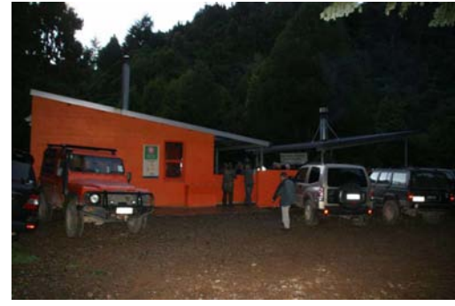
When the day run became a night run....