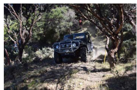
Neil Blackie from CCVC making good progress on the new creek hazard.