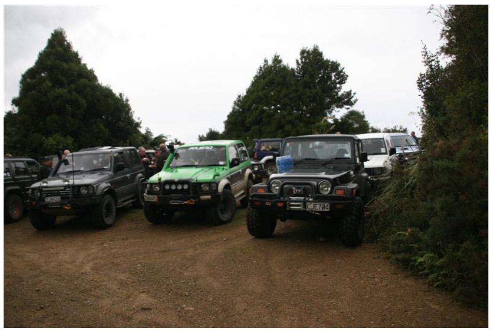
Lunch time - thanks to Mangaroa School