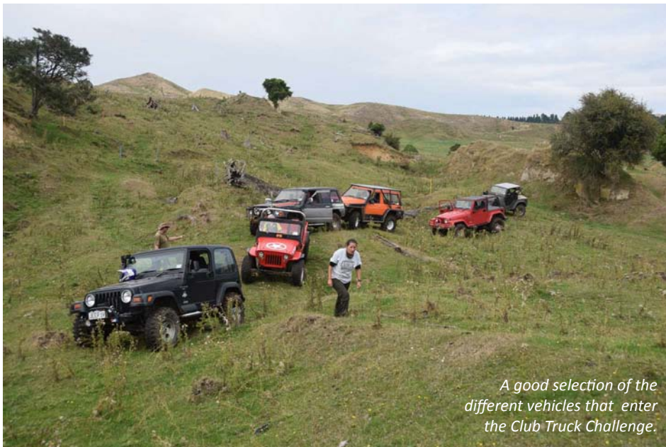
A good selection of the different vehicles that enter the Club Truck Challenge.

Desert Defenders Off Road Club join the Club Truck Challenge.