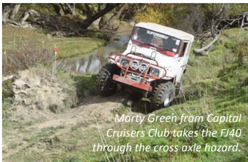
Marty Green from Capital Cruisers Club takes the FJ40 through the cross axle hazard.

This property had wide open spaces which allowed room for four different speed sections including one which was run as a side by side drag race. Bruce and I lined up our Wranglers for a dogleg drag down to a donut around peg and back. Bruce wisely kept his distance from my wildly out of control drifting thanks to the low tyre pressures, thankfully bead locks kept the rubber on the rims. The handy river was used for a number of hazards, most of them having difficult climbs back out of the water.