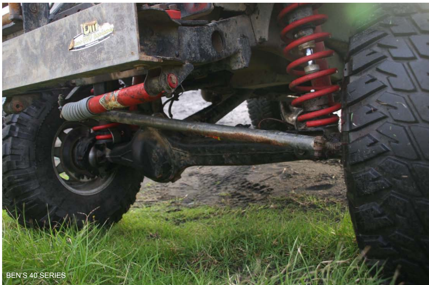
BEN'S 40 SERIES

I have heard people say that LVVTA could be replaced by another body that will have less control and make it easier to get your hobby vehicle road legal. This would be nice, but I am more likely to grow a third leg than the government allowing anything like this to happen. I really hope that we all support LVVTA and its staff and contractors. They are not perfect, but they are working hard to allow us to have the vehicles we want, and they are a hell of a lot better than the alternative.