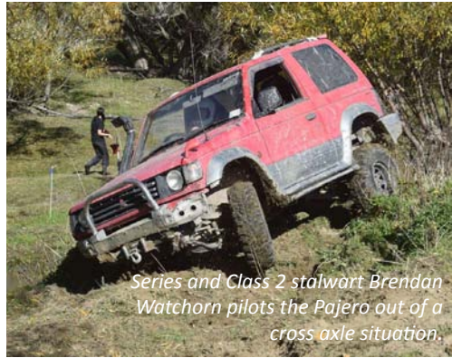
Series and Class 2 stalwart Brendan Watchorn pilots the Pajero out of a cross axle situation.