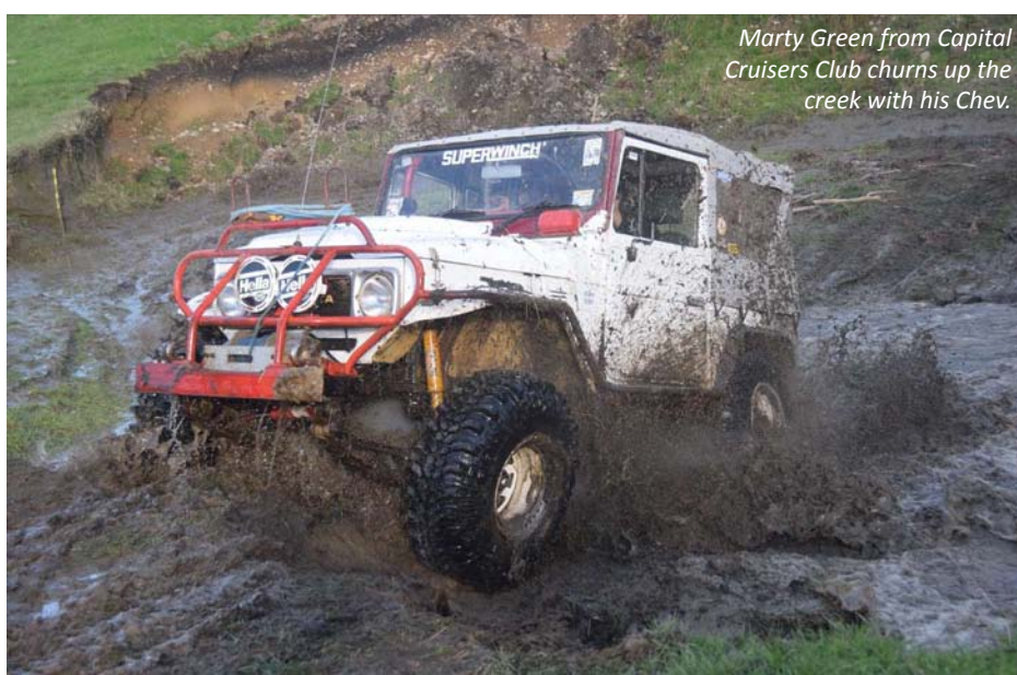
Marty Green from Capital Cruisers Club churns up the creek with his Chev.

The Class results for the whole 2015 Series have been posted on www.sportsground.co.nz/czctc . Mark calculated the positions from your best three results in your Class. I calculated something different which I posted in my magazine article in NZ4WD magazine (thanks for your support over the season, Editor Ross). I used overall position because some of the Class 1 and 2 guys posted good results that beat Class 3 guys. I also used best four results because we had a good number of people who did all five Rounds and it seemed unfair not to support people who support the series. This combination makes me look pretty good!