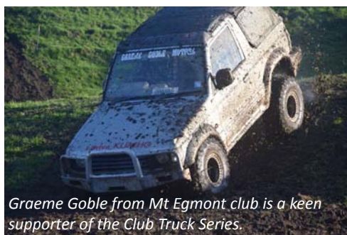
Graeme Goble from Mt Egmont club is a keen supporter of the Club Truck Series.