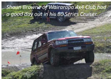
Shaun Browne of Wairarapa 4x4 Club had a good day out in his 80 Series Cruiser.