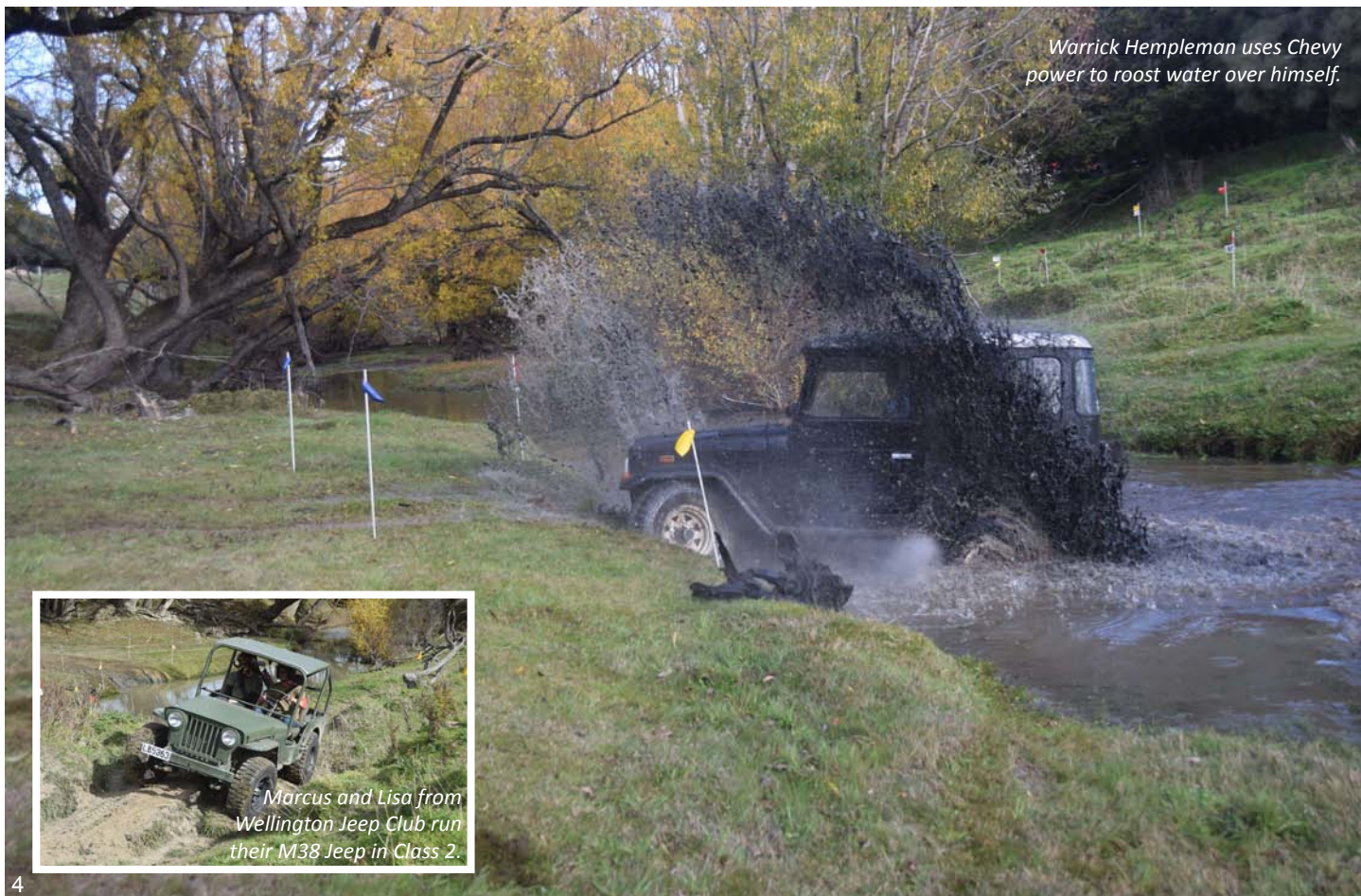
Warrick Hempleman uses Chevy power to roost water over himself.