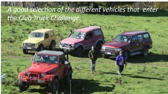
A good selection of the different vehicles that enter the Club Truck Challenge.