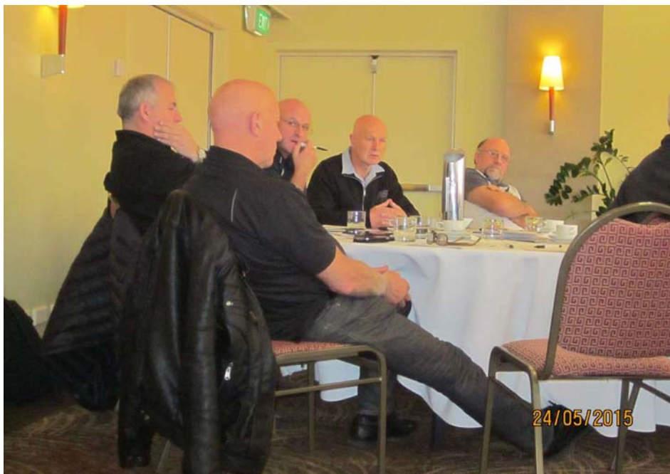
Inside the NZFWDA AGM