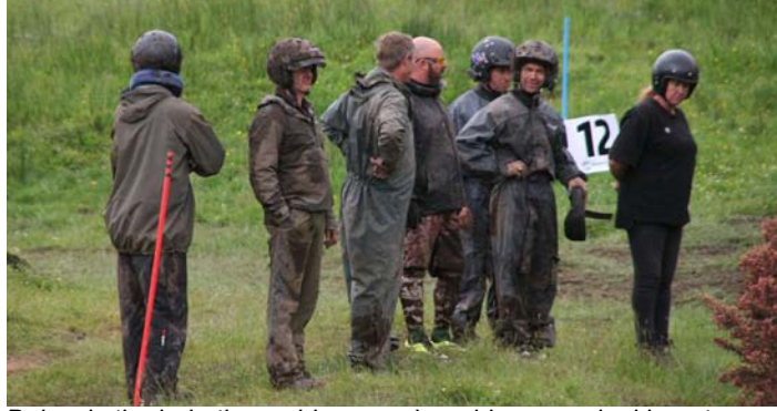
Below is the hole these drivers and co-drivers are looking at....