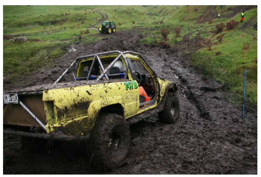
Dwayne Mead in the Hilux - loving it!