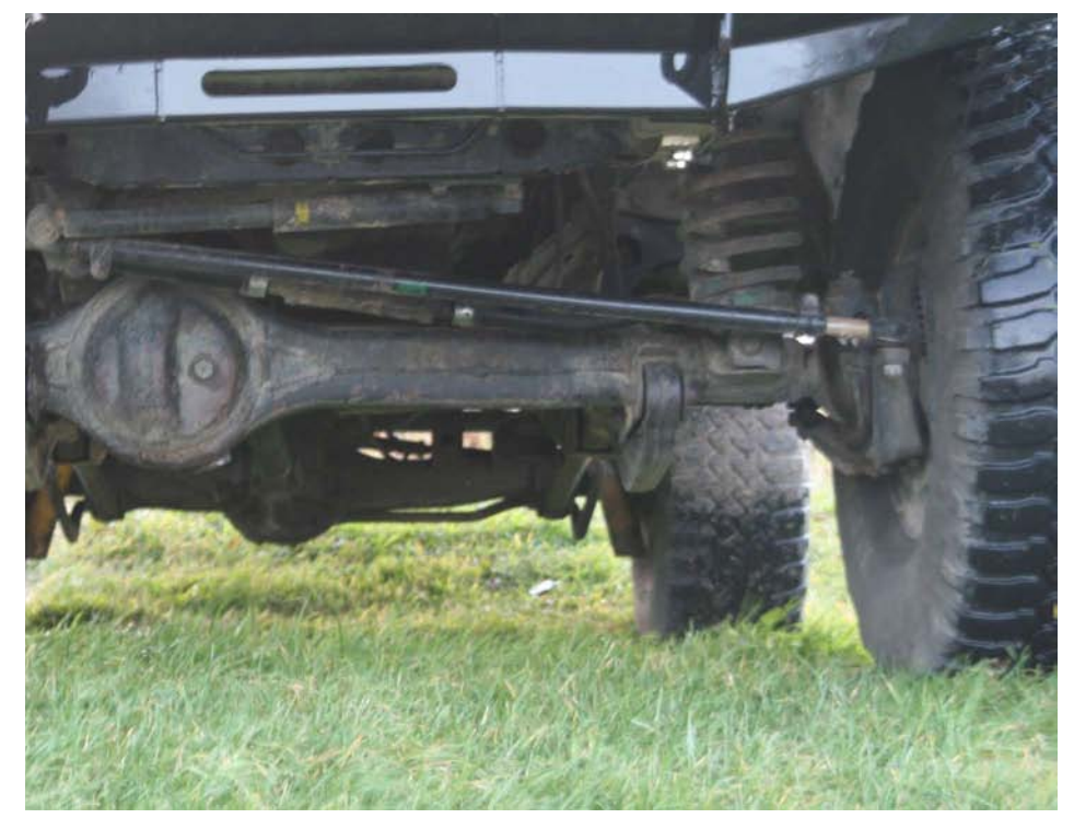
...it is important to remember that none of this is set in stone....

winding up the torsion bars so much that the top "A" arm is hard up against the bump stop, hence he would have no suspension travel downward, the same goes for a suspension lift fitted that is so high that it places the top A arm up against the bump stop, again no travel in downward or droop.