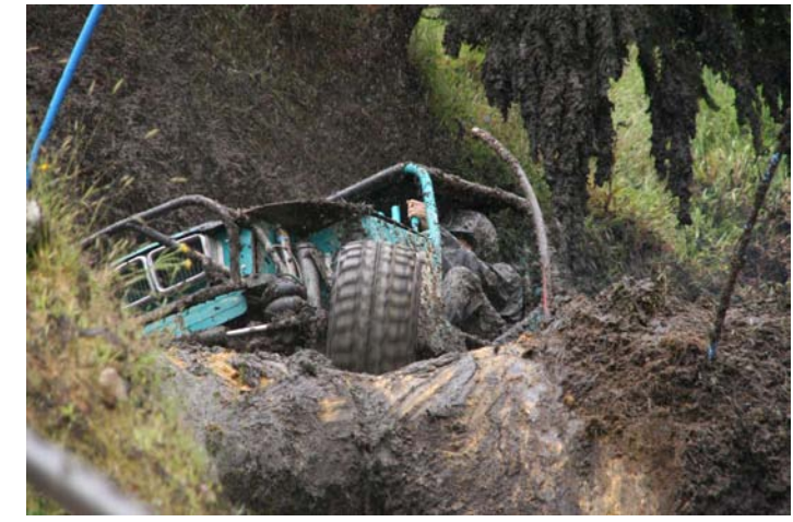
The nasty rock before the bog run was a digger pull for some.