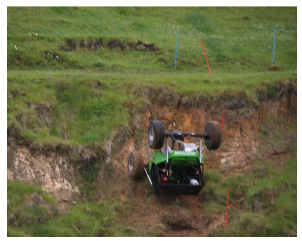
Spectacular back filp across the gulley!

ROUND 2, HOSTED BY SOUTH WAIKATO 4X4 CLUB - 21 NOVEMBER 2015.