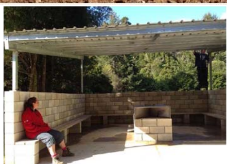
Measuring a cool 6 metres along all three walls, there's plenty of room for all!

Sign up as a volunteer and monitor Orange Hut progress at http://arac.org. nz/index.php/orange-hut-project/