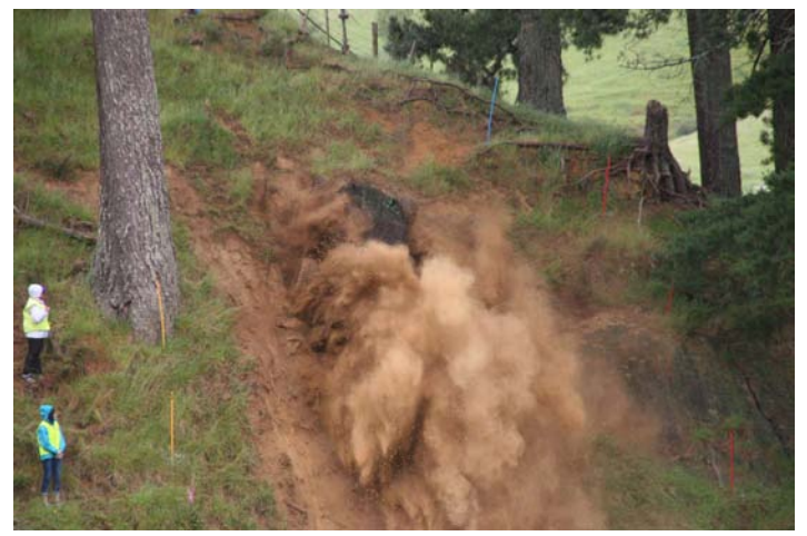
Different terrain - kept the drivers and navigators on the throttle.