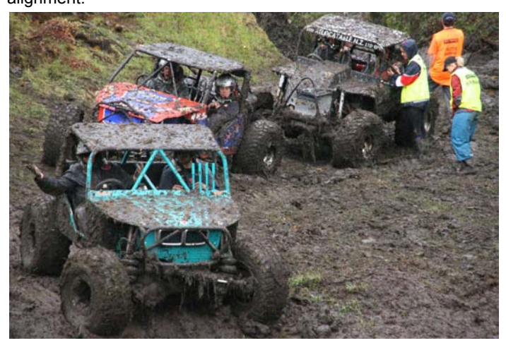
Bog run start line... ...you will be right boys...