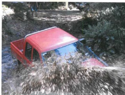
Details of this photo page 4

P.O. Box 228 Nelson May 2008 http://www.swdnz.net