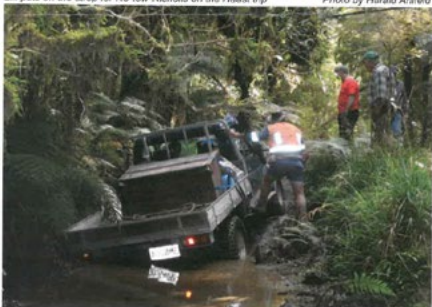
Another one bogs the mud!