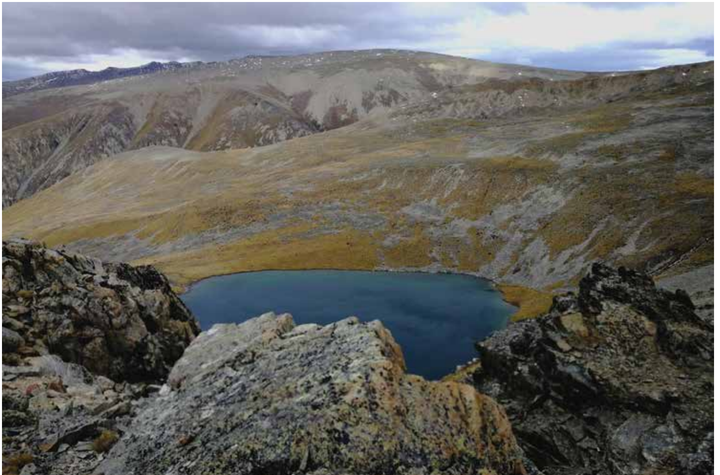
Hidden Lake in the Otago Conservation Park. Not quite 2000 metres around 1980 metres that's high! The party was split in two. The other party claimed they found an extra bit of the Mountain and drove up a track to around 2100 metres. Well done to them! that's probably as high as you can go in a Four Wheel Drive in NZ.