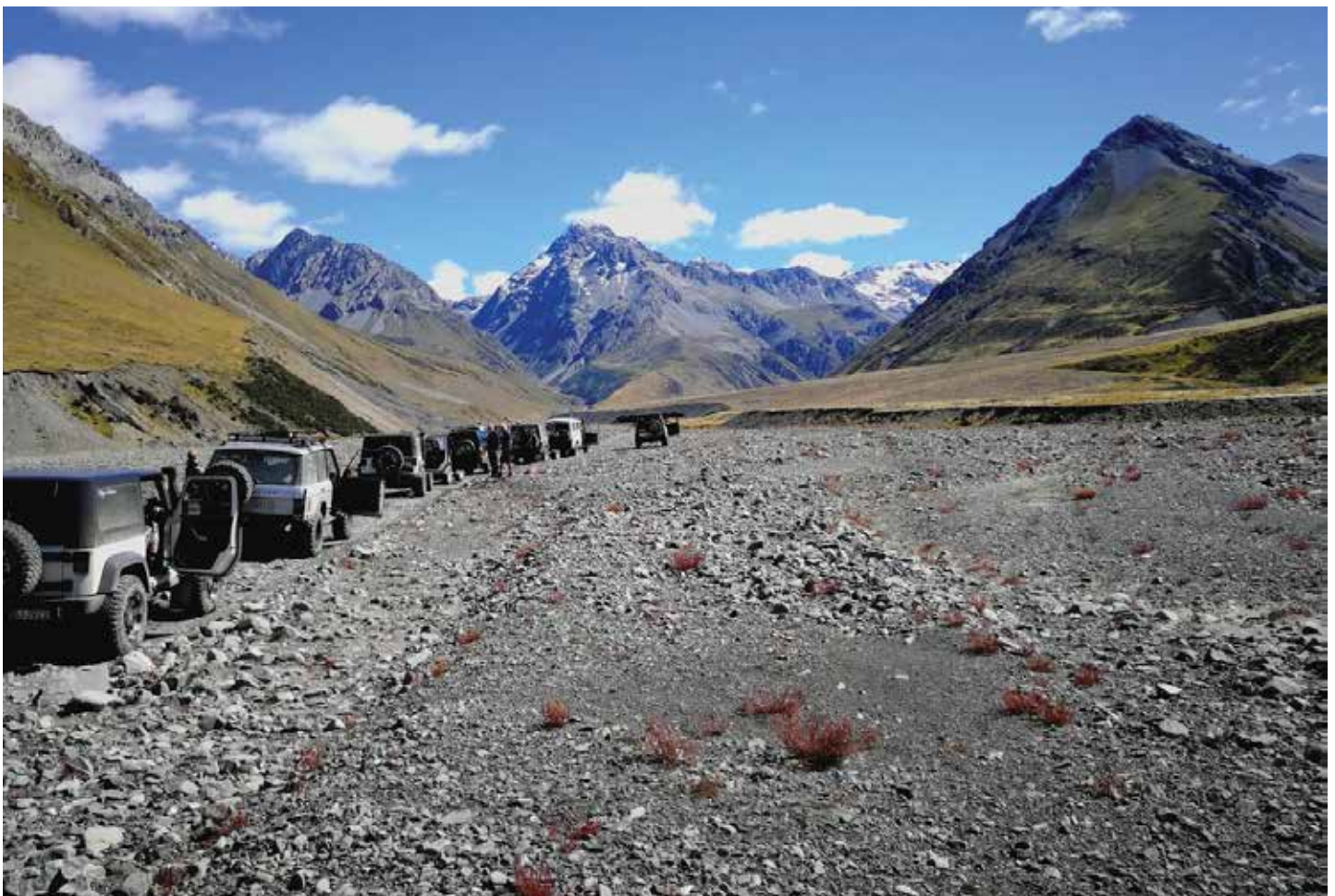
A stop along the way to admire the Cass Valley on the way to Memorial Hut.