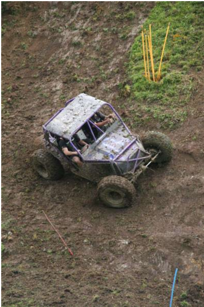
This was a tight turn....on a hill, that was slippery....saw some impressive turning manoeuvres... even backwards?!