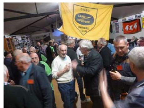
Friday night Nag and Natter