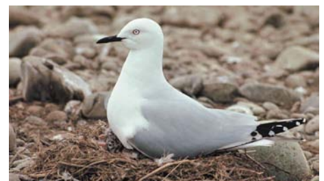
Black Bill Gull