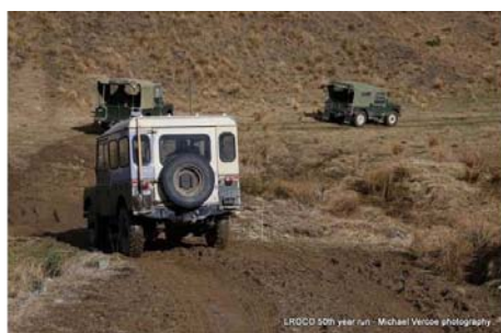
The old girls still showing how capable they are.

Brilliant trip on the Maungatua Range on a clear Autumn day for most of the time anyway. Heaps of vehicles and great to see the old Landies out with the guys and gals all dressed up in their County gear.