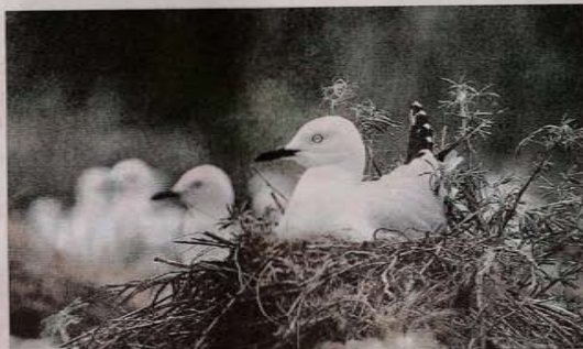
Pretty birds - Ashburton black billed gulls and their breeding struggles could be beamed around the world.