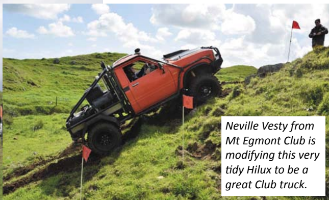
Neville Vesty from Mt Egmont Club is modifying this very tidy Hilux to be a great Club truck.