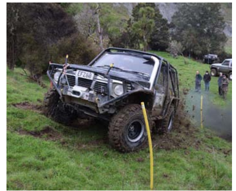
Peter Robinson from the Manawatu club has competed in many rounds of the Club Truck Challenge in the past.

the preceding person got stuck and spun holes in the course. These conditions favour people with the best and newest tyres and Alan and Shona Stone were having a good day in their Toyota Landcruiser. Hazard 8 had an easy line that only lasted for three drivers before it got chopped out. We finished the day with side by side drag races where you were paired off with a similar machine and had a timed run down both