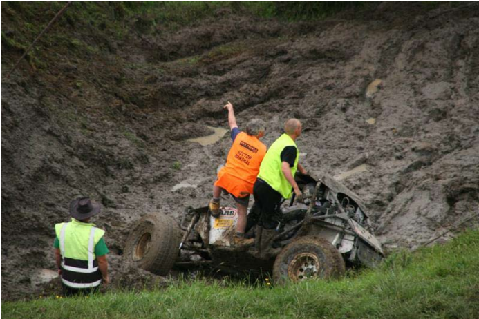
Marshals steady the vehicle while the recovery vehicles are moved into position to extract the stuck vehicle.