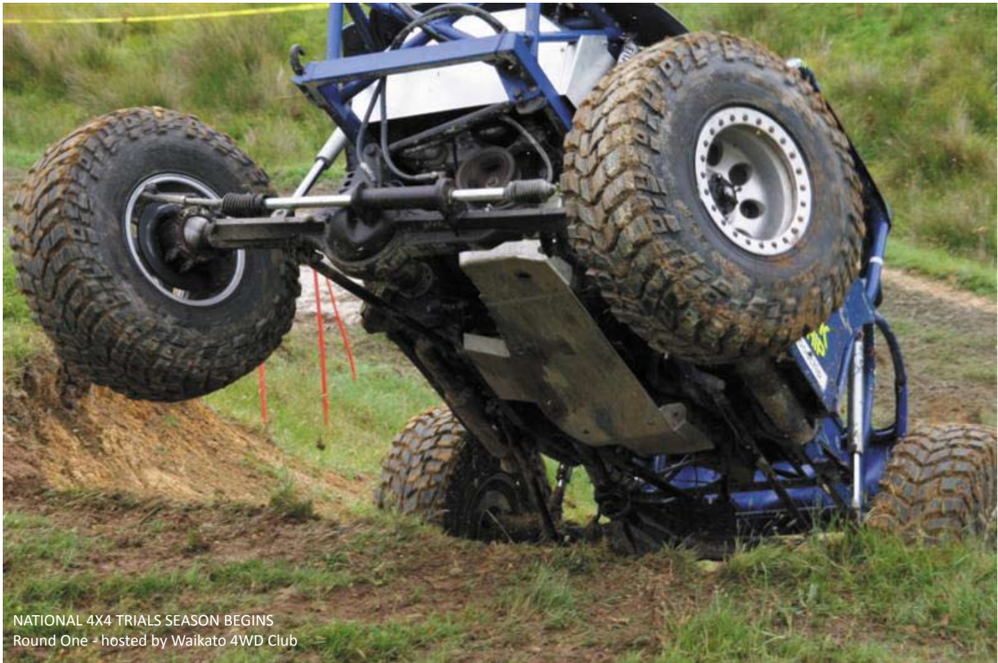
NATIONAL 4X4 TRIALS SEASON BEGINS Round One - hosted by Waikato 4WD Club

Trail Torque is produced four times a year and delivered via the NZFWDA Membership email database. This issue: Dec/Jan/Feb 2017 • Next issue Mar/Apr/May 2017