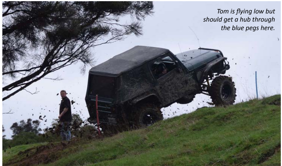
Tom is flying low but should get a hub through the blue pegs here.