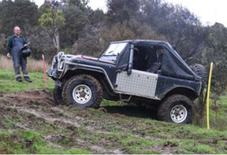
Neil Blackie from CCVC in Wellington is constantly modifying this Land Rover to make it bulletproof.