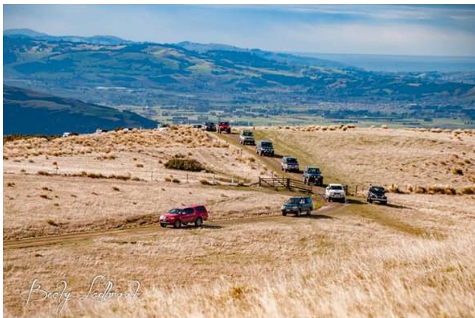
Plenty of other makes along as well. How lucky are we having this country on our doorstep. Mosgiel and Dunedin in the background.

Saturday evening dinner, more reminiscing and a run through of the Clubs history with trips, buying the Club land, camping tales at the Club camp on the Lindis and a rendition of a couple of amazing poems and songs from past and current members and to boot a pretty good feed.