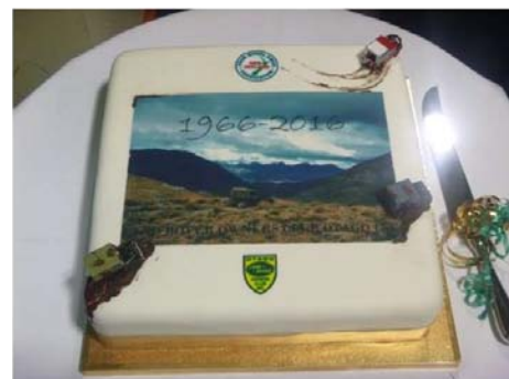
A lot of love went into making this.