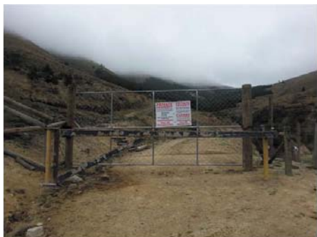
Not much chance in getting through here without some decent "illegal access gear".

There is also an issue with the Clayton Pack Track where access has been blocked off by the local land owner and several organisations have been active in getting access back on