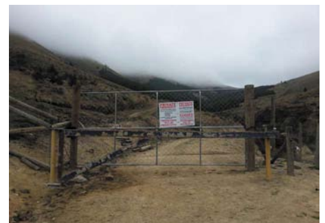
Barrier on Clayton Pack Track