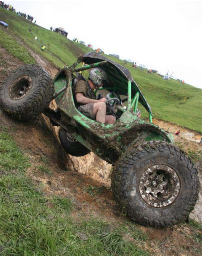
It is about here they decide if they are going left or right into the bog...