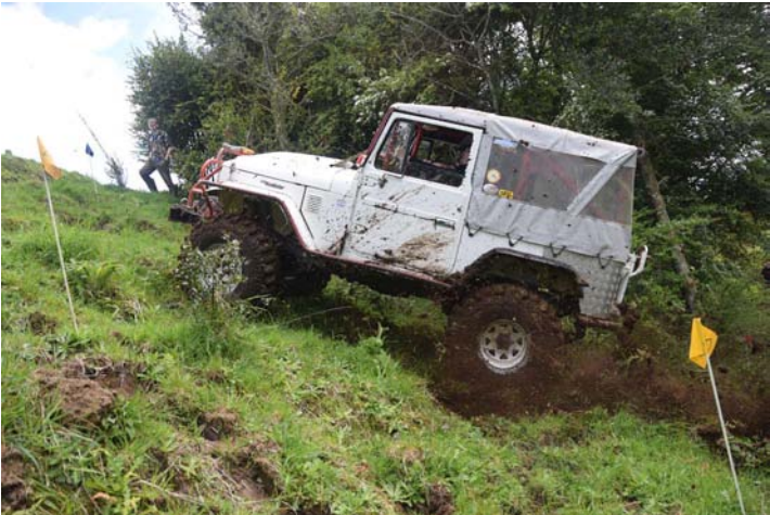
Marty Green's Cruiser using Chevy power to zero a hazard.