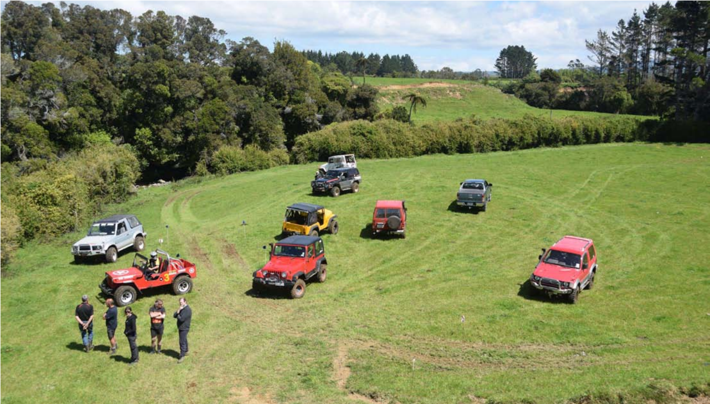
A good view of a selection of wagons entered in this Round, mainly short wheelbases in this case.