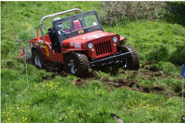
Ross Gregory's Jeep surges out of the bog taking advantage of its low weight.