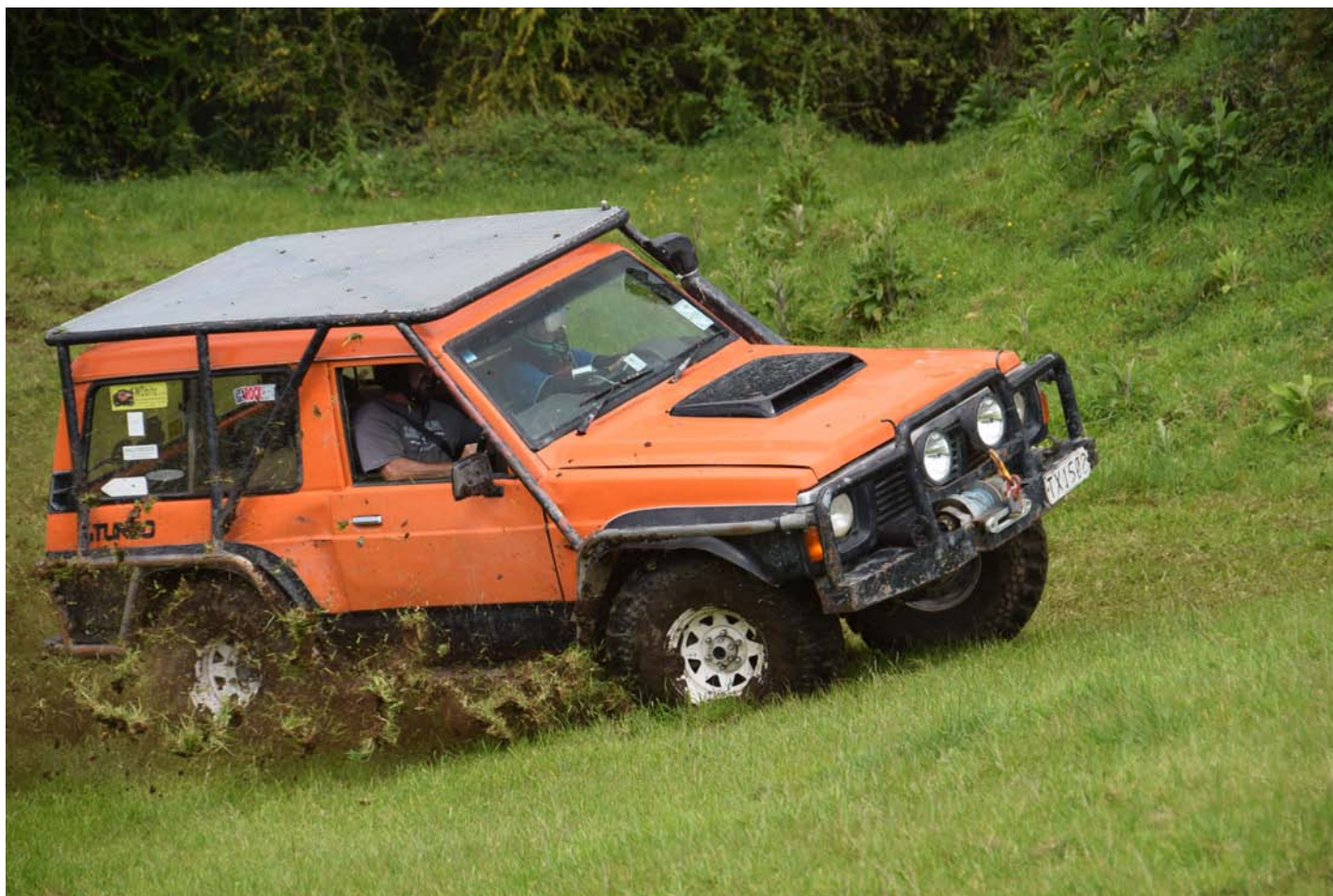
Deane and Sandra shred the grass in the first Speed section.