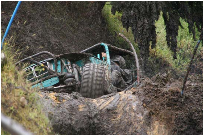
The nasty rock before the bog run was a digger pull for some.