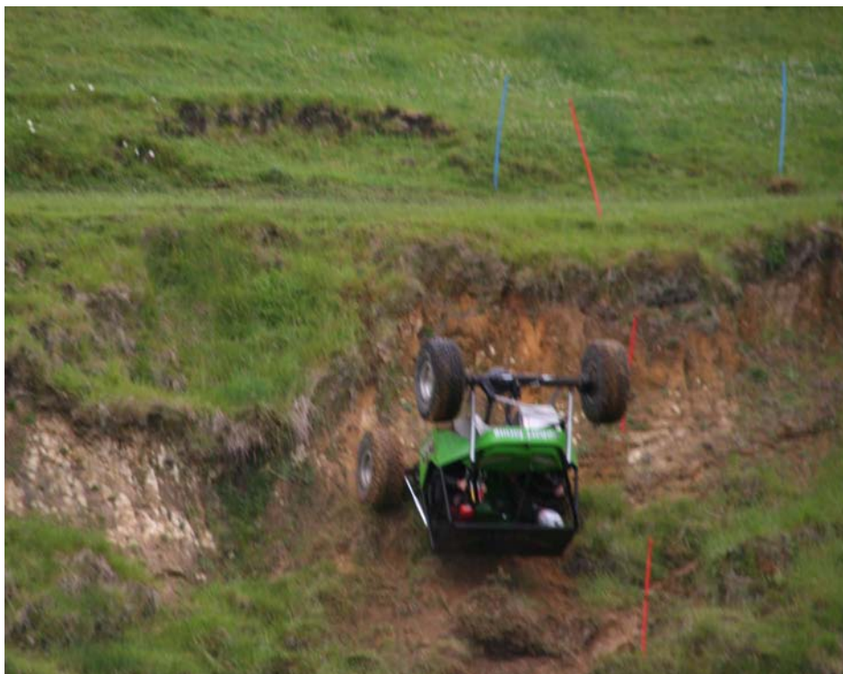
Spectacular back filp across the gully!

ROUND 2, HOSTED BY SOUTH WAIKATO 4X4 CLUB - 21 NOVEMBER 2015.