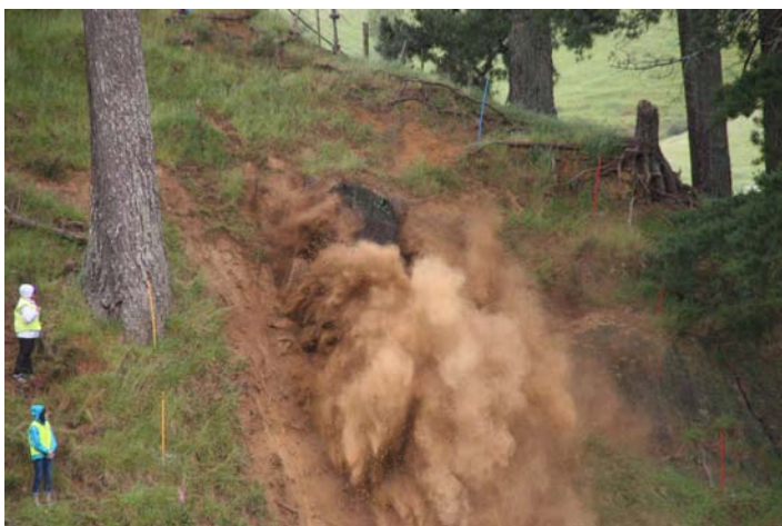
Different terrain - kept the drivers and navigators on the throttle.