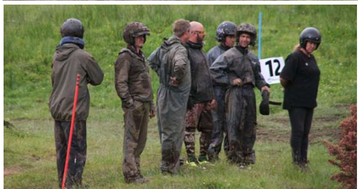
Below is the hole these drivers and co-drivers are looking at...