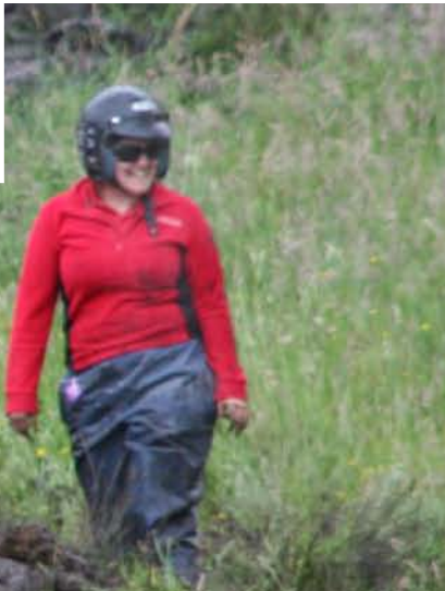
the line through wasn't on the left.