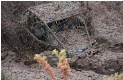
...this one didn't