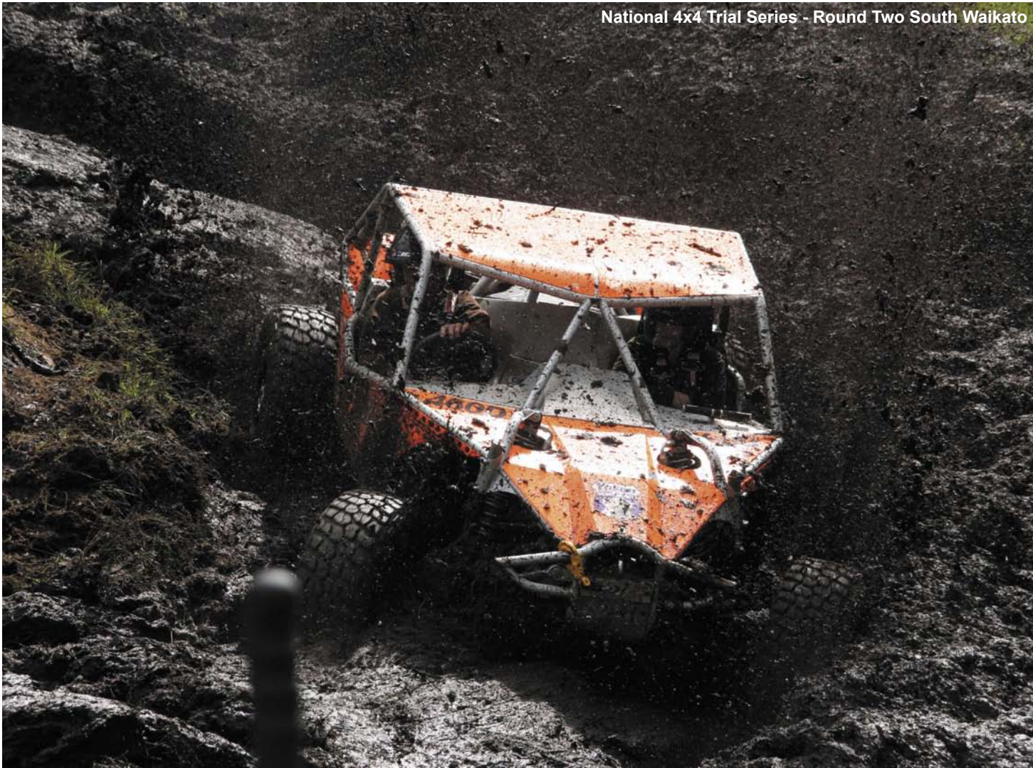
National 4x4 Trial Series - Round Two South Waikato

This issue: December 2015/January/February 2016 • Next issue March/April/May 2016