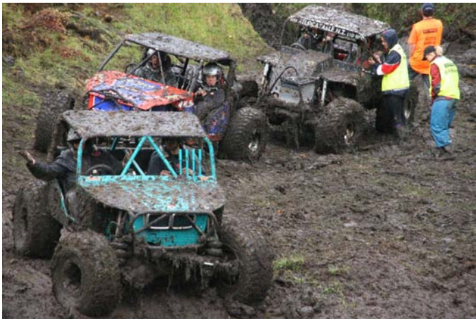
Bog run start line... ...you will be right boys...