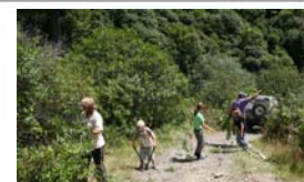
42 Traverse working bee 2007

This information is intended to help make hunters and other recreational users aware of the issues out at Rangitaiki, and to let them know that the department, local landowners and the NZ Police are looking at our options for managing this site.