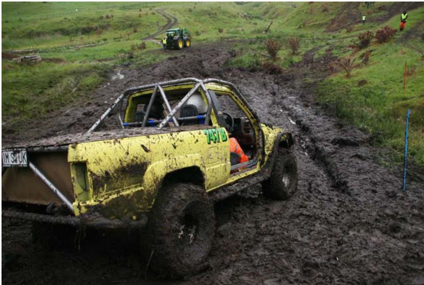
Dwayne Mead in the Hilux - loving it!