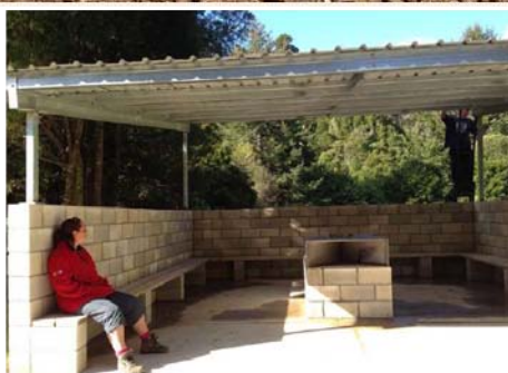
Measuring a cool 6 metres along all three walls, there's plenty of room for all!

Sign up as a volunteer and monitor Orange Hut progress at http://arac.org.nz/index.php/orange-hut-project/