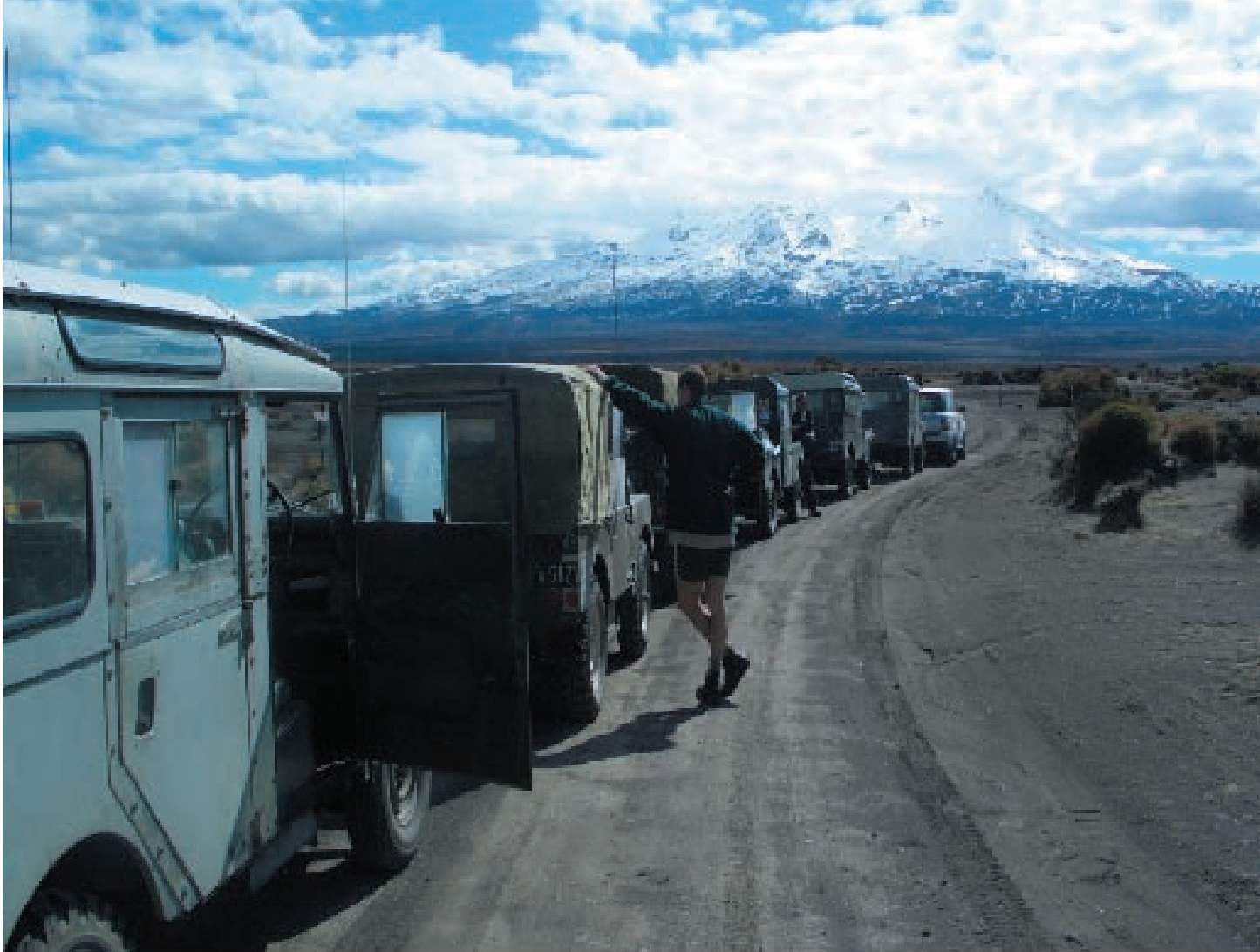
Tool box talk at the 2015 NZFWDA National Conference.

This issue: June/July/August 2015 • Next issue September/October/November 2015