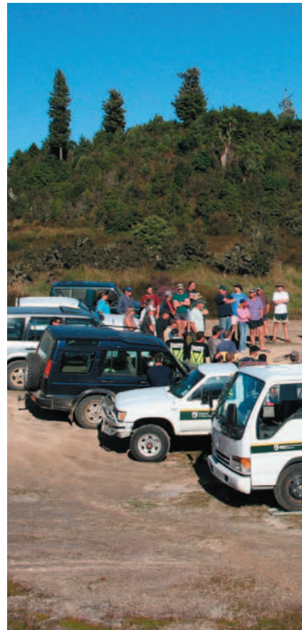
42 Traverse Working Bee - Feb 2007

Area manager, Southern Region Access Homehealth Dunedin