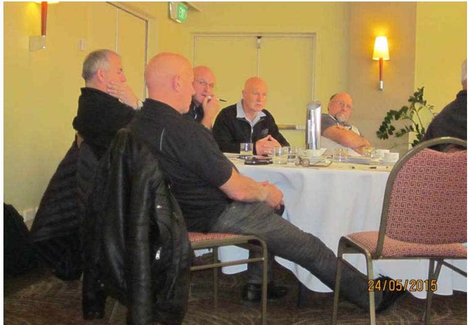
Inside the NZFWDA AGM